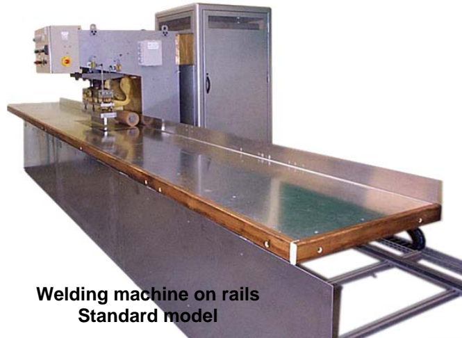
Welding machine on rails Standard model

Options: electric supply, power, compressed air are similar as on "C" structure welding machines.